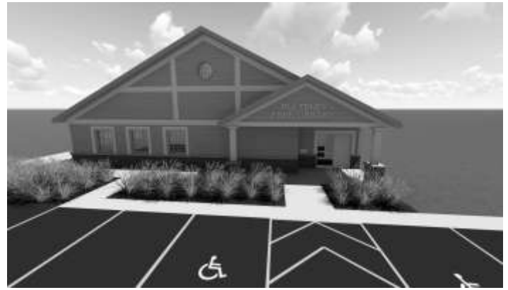
PROPOSED NEW LIBRARY

November 11 at 11:00 will be our Annual Meeting. Please join us as we thank our volunteers and look at our year in review. We will also have updates on our fundraising for the new build-